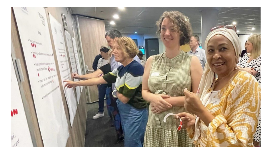
Participants in the first Leadership Forum rate environmental factors using 'Dotmocracy'.

Interestingly, Leadership Forum participants were not prepared to back any specific technology. Instead, they said the sector needs to be ready to follow listeners to their technology of choice. The sole technological trend, 'ongoing migration from analogue radio to in-dash digital systems in cars', only came in at seventh place. The 'increasing media desertification in regional Australia' came in at number three and the predicted shift by governments from funding 'activities to outcomes' completed the top ten overall.